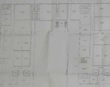
GROUND FLOOR PLAN SCALE: 1" = 16'0"