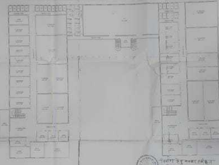
FIRST & SECOND FLOOR PLAN